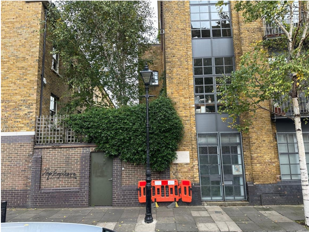
Blackbird Yard from Ezra Street