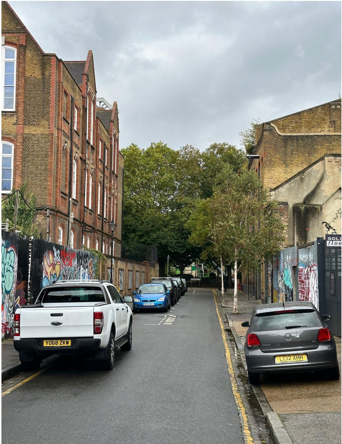
Entrance to 'Solid Floor'