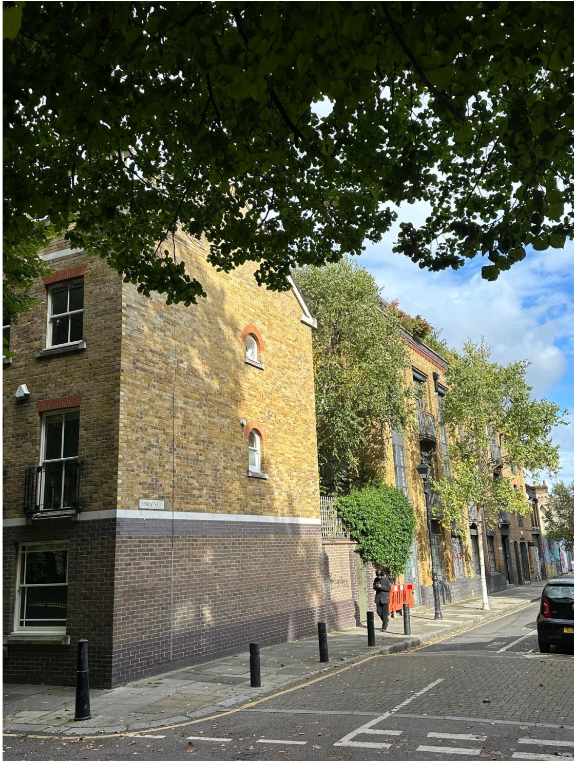
Views into Ezra Street from junction with Ravenscroft Street