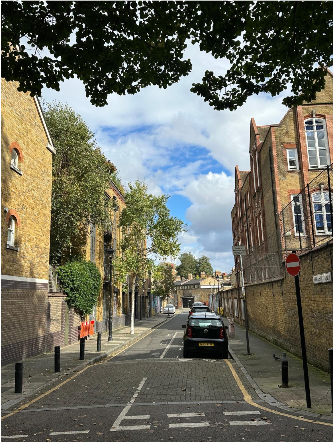
Blackbird Yard to the left, 'Bold' property to the right