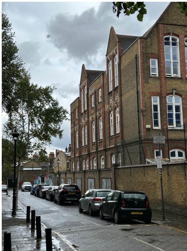
View from outside 'Solid Floor' looking towards Ravenscroft Street. 'Bold' building to the right, Blackbird Yard out of view beyond.