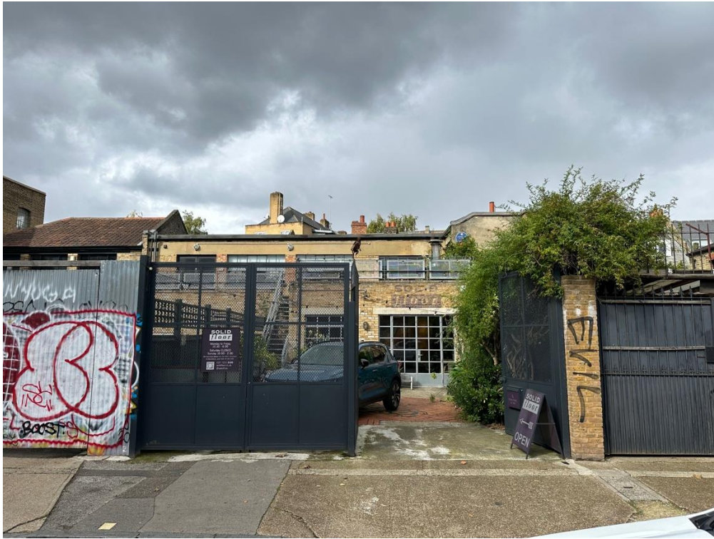
View from 'Solid Floor' balcony onto Ezra Street